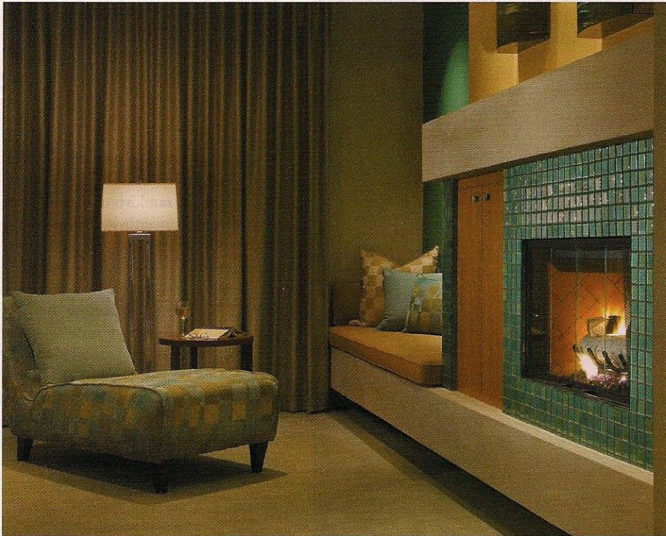
Above: Aquamarine glass tiles add subtle color to the master suite's sitting area.